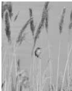
Reed Warbler

One more to listen out for is the reed warbler which can be heard and seen amongst the reeds on either side of the Aust ferry landing. Its squeakier, scratchy song also announces the arrival of warmer times.