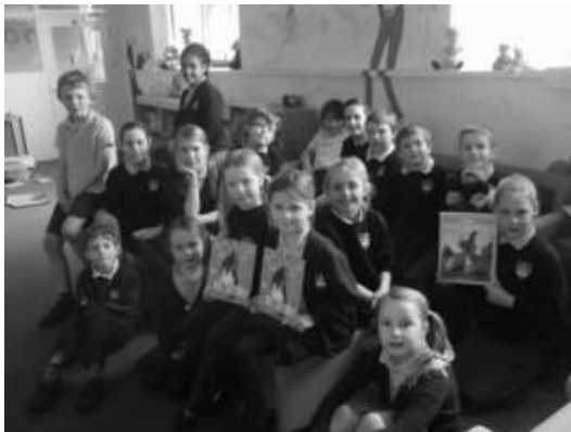
'Rights Respecting' champions at Olveston School

During the last week of term (Mon 31 st March – Fri 4 th April) we will also be taking part in the South Gloucestershire 'Big Spring Clean'. Led by our Eco Warriors we will be spending time cleaning the school and grounds and hope to spread out into the community – look out for our litter pickers around the village. We would welcome any members of the community who would like to join our 'Big Spring Clean'. Please contact the School Office on 01454 613299 to register your interest.