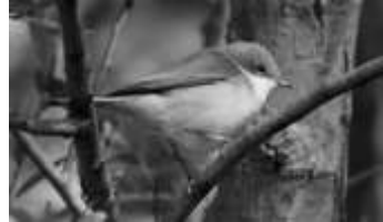
Lesser Whitethroat

Its cousin the willow warbler will also arrive. Unfortunately, if you do see it, it will be almost indistinguishable from the chiffchaff; the difference mainly down to the colour of the legs, black for a chiffchaff and flesh coloured for a willow warbler. Oh! And a slight tinge of yellow on the willow warbler. But of course you have to find them first and the beginning of April is a good time as there is no leaf cover. But if you don't immediately see them, hear them you will, the chiffchaff certainly chanting to distraction, the willow warbler with its descending, rolling and musical song.