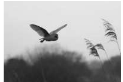
Barn Owl

Being mainly white it is easy to pick out from the rest of the brown speckled owls. One is sometimes seen at Aust Warth in the early evening.