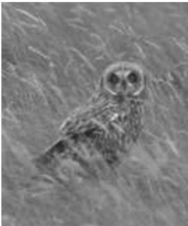
Short-Eared Owl

Also at Aust one can often find the Short-Eared Owl. This is a larger bird which is happy to spend the day in the long grass and then emerge at dusk to hunt along the Warth. Look for the birders watching the owls for a clue to their presence.