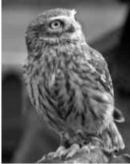
Little Owl

There is a tradition amongst birders that if they only hear a bird they enter an 'H' against in their records to indicate that they only 'heard' it. When it comes to owls they are more often heard than seen for the obvious reason that they are mainly nocturnal.