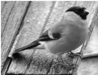
Bullfinch

However, the most beautiful visitor is the goldfinch which will visit, especially if you provide Niger seed. They usually approach in a group or “charm”, constantly chattering to one another. It is a very distinctive bird with its red face and buff colouring and with the bright yellow wing bar that gives it its name.